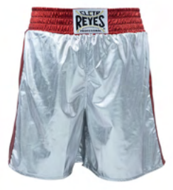
SHINE WHITE & RED