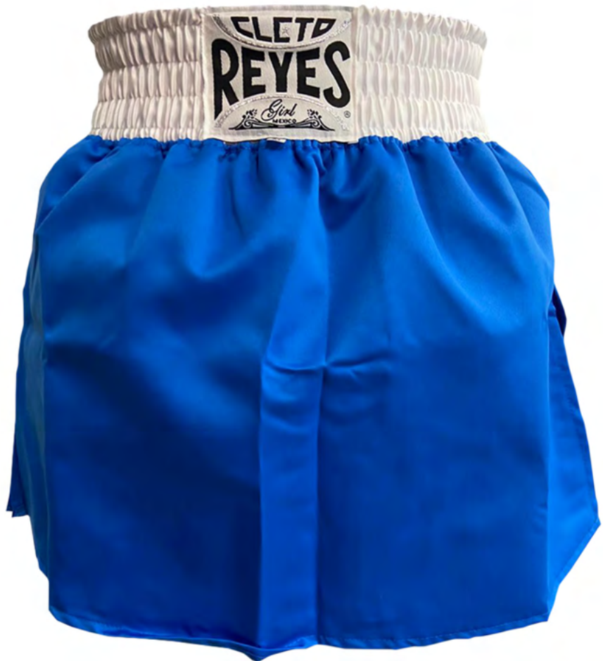
C332ZB | BLUE & WHITE