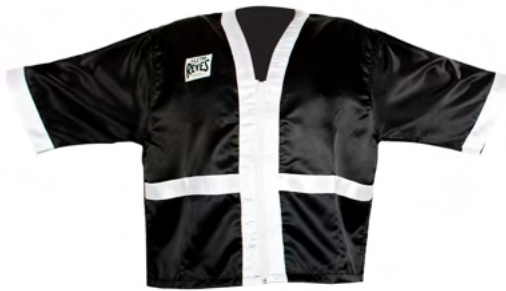
BLACK & WHITE