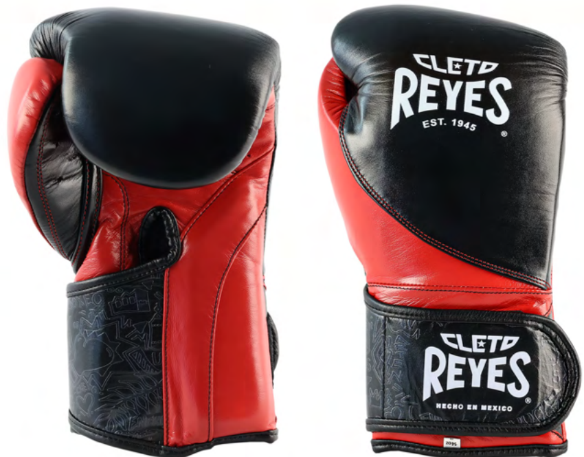
E700NR | BLACK & RED