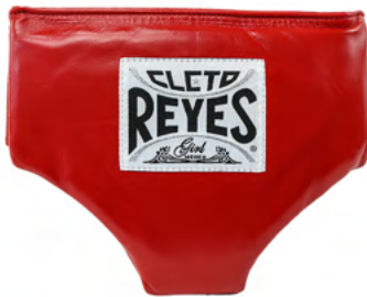
COLORWAYS: RED, METALLIC PINK