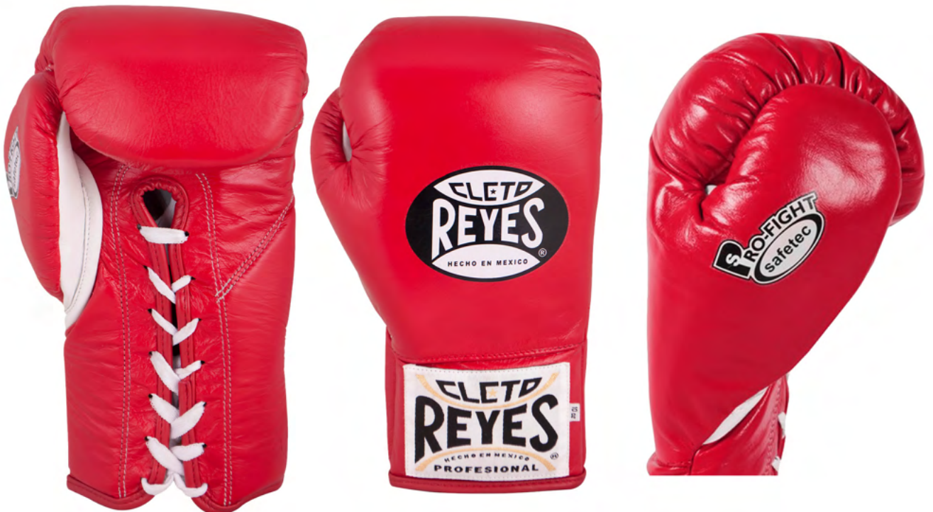
B410R | CLASSIC RED