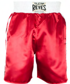
RED & WHITE