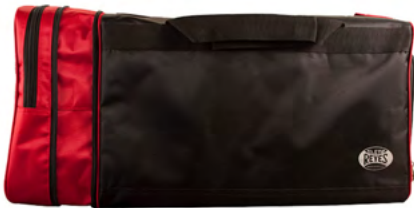
BLACK & RED