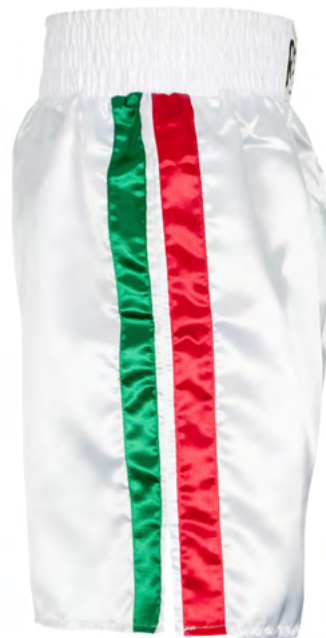
C536M | MEXICAN FLAG