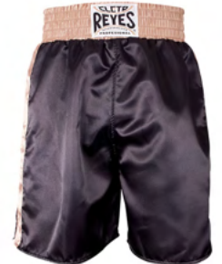
BLACK & GOLD