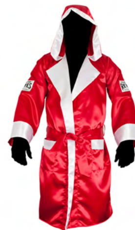
RED & WHITE