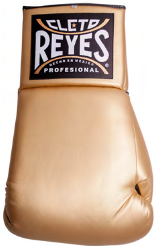
A005 | GOLD

COLORWAYS: RED, BLACK, BLUE, YELLOW, GOLD AND WHITE