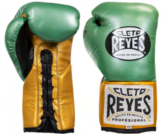
WBC GREEN / GOLD & BLACK

The most recognized professional boxing gloves worldwide are an authentic mexican craft they are 100% handmade with premium and texturized leather, extra long laces and a slim design. Anatomically design with attached thumbs and water repellent lining give every boxer the best protection and comfort.