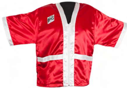
RED & WHITE