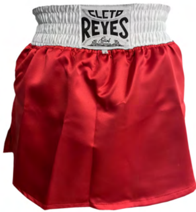
RED & WHITE