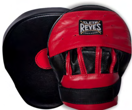
BLACK & RED