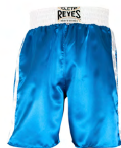
BLUE & WHITE