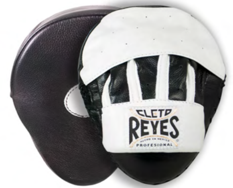
BLACK & WHITE