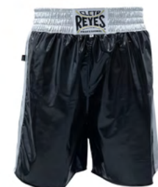
SHINE BLACK & WHITE