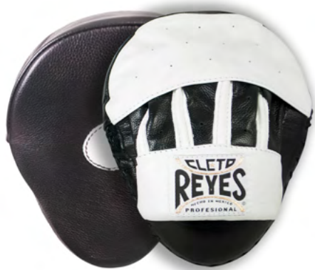
BLACK & WHITE