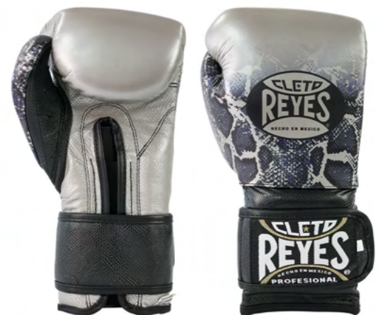
STEEL SNAKE / BLACK

Handcrafted leather strap with hook and loop closure gives a firm and faster adjustment of the glove for an ultimate training performance. Ideal for training, sparring and punching bag workouts.