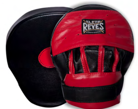
BLACK & RED