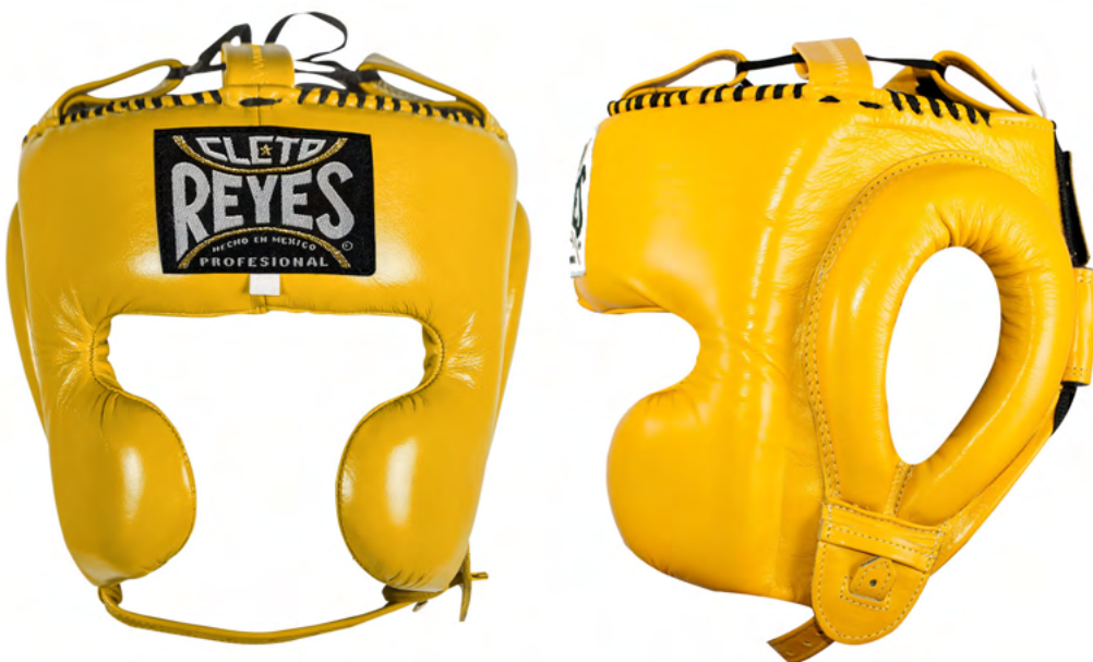
E381A | YELLOW