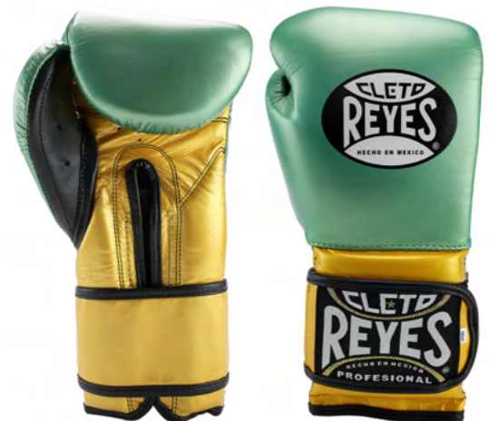
WBC GREEN / GOLD & BLACK

Handcrafted leather strap with hook and loop closure gives a firm and faster adjustment of the glove for an ultimate training performance. Ideal for training, sparring and punching bag workouts.