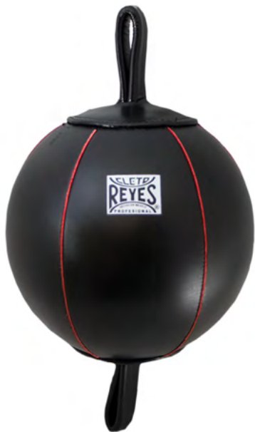
BLACK (ONLY COLOR AVAILABLE)