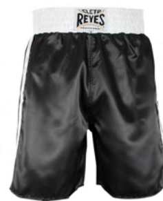
BLACK & WHITE