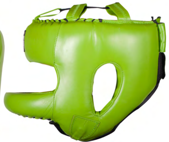
E387CG | CITRUS GREEN