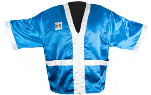
BLUE & WHITE