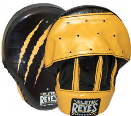
BLACK & GOLD