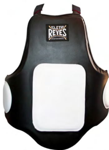
BLACK & WHITE