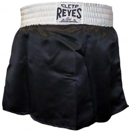
BLACK & WHITE