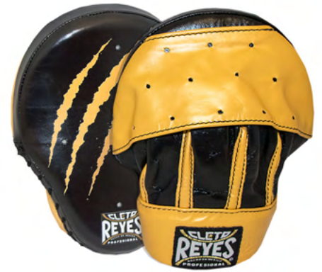
BLACK & GOLD