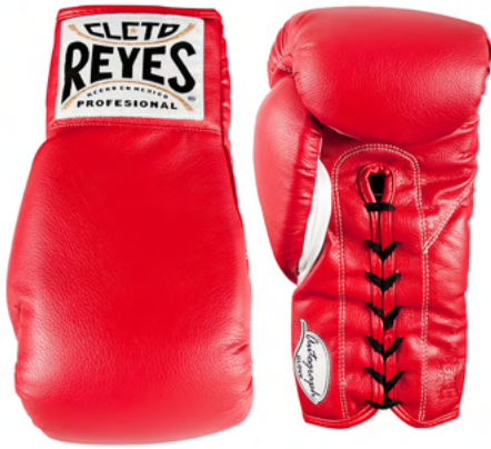
A320 | RED