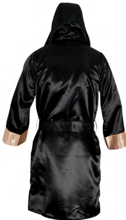
C636NO | BLACK & GOLD