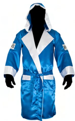
BLUE & WHITE