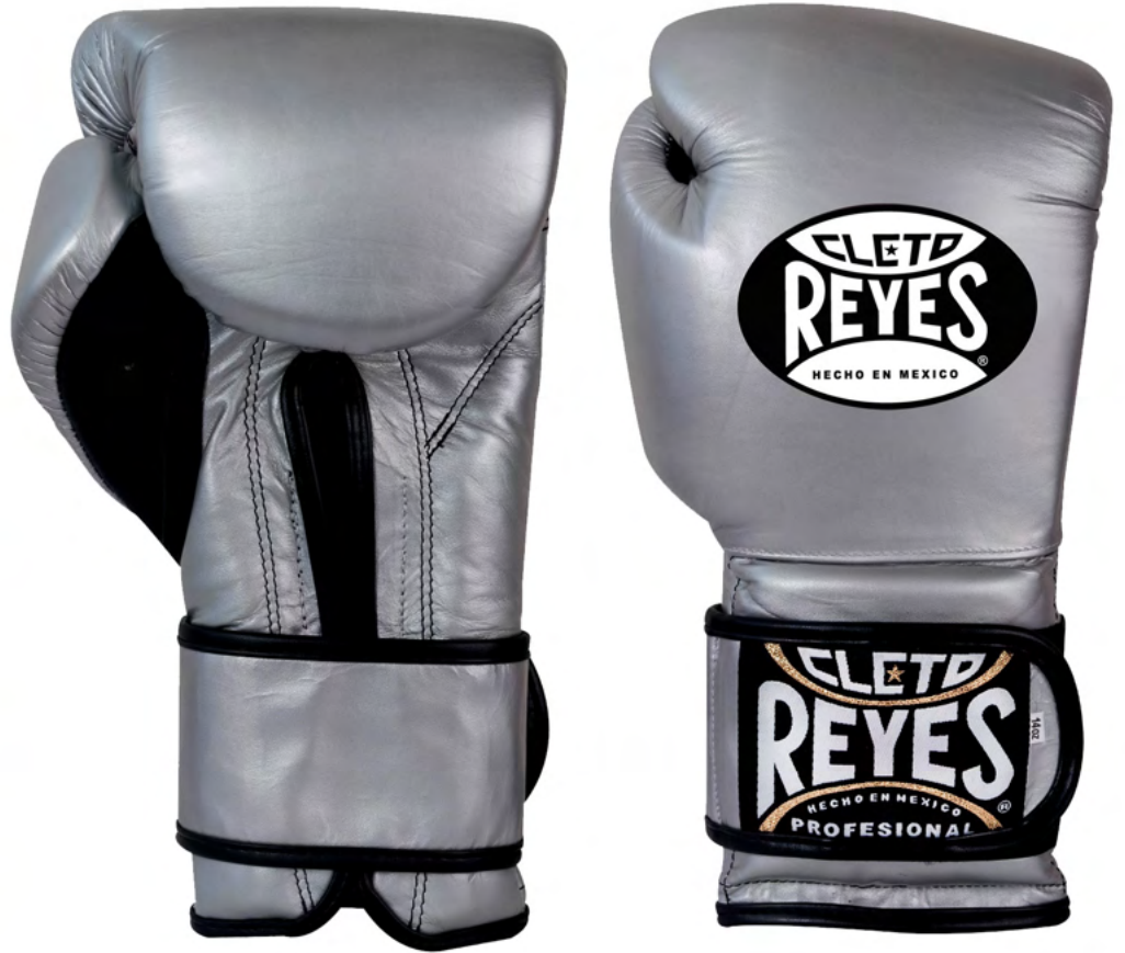
E614L | SILVER BULLET

*Some colors may not be available in all sizes