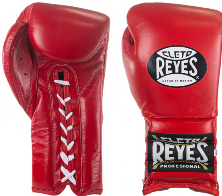
E414R | CLASSIC RED

*Some colors may not be available in all sizes