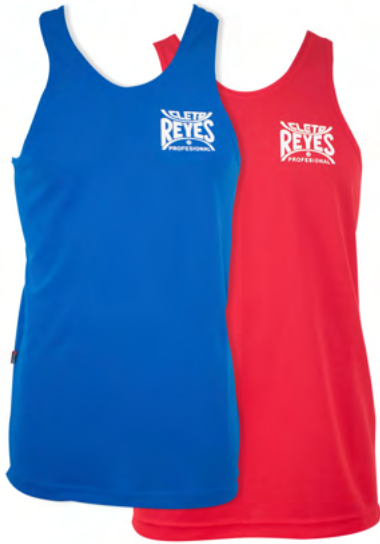
BLUE & RED