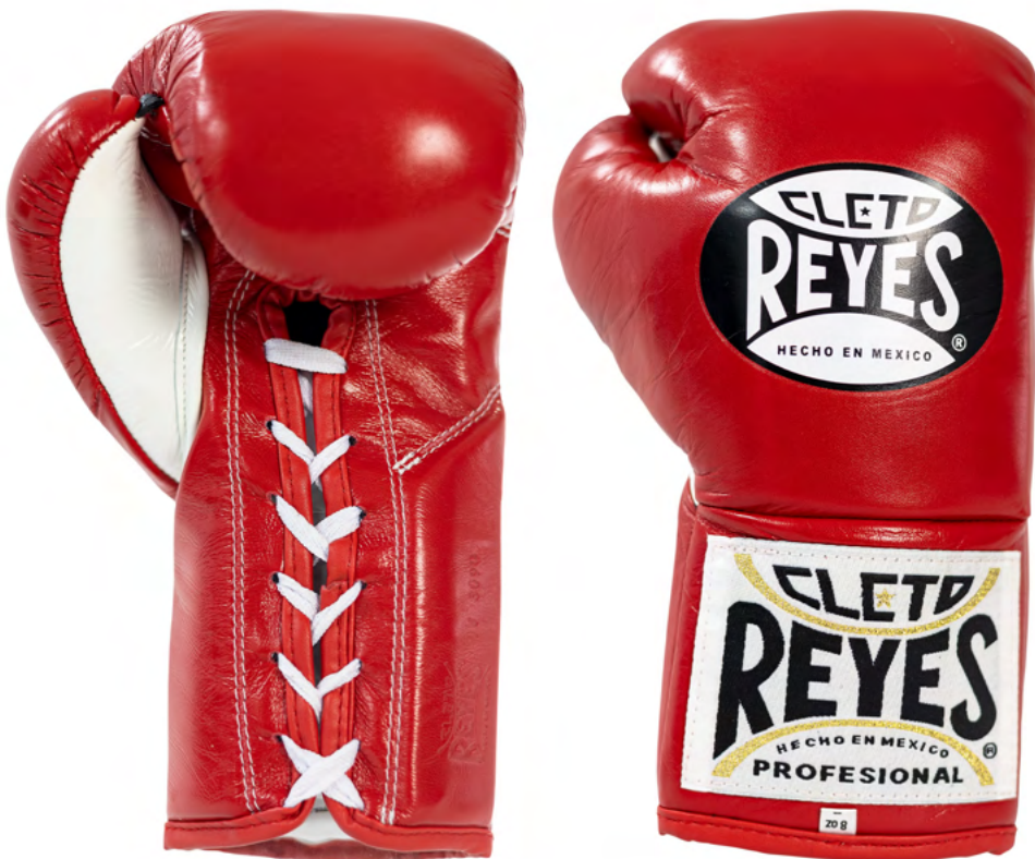
B208R | CLASSIC RED