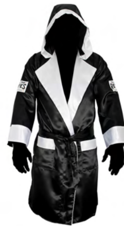
BLACK & WHITE