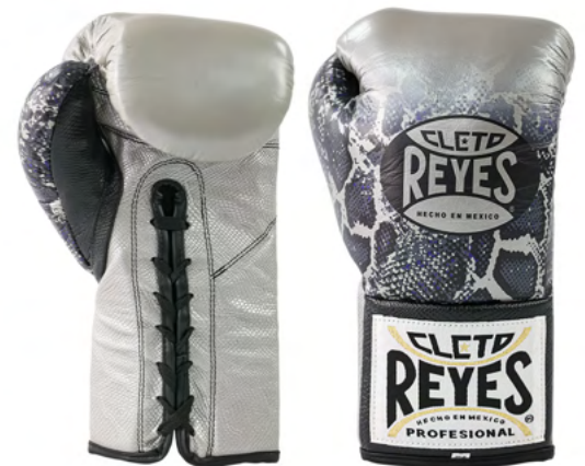
STEEL SNAKE / BLACK

The most recognized professional boxing gloves worldwide are an authentic mexican craft they are 100% handmade with premium and texturized leather, extra long laces and a slim design. Anatomically design with attached thumbs and water repellent lining give every boxer the best protection and comfort.