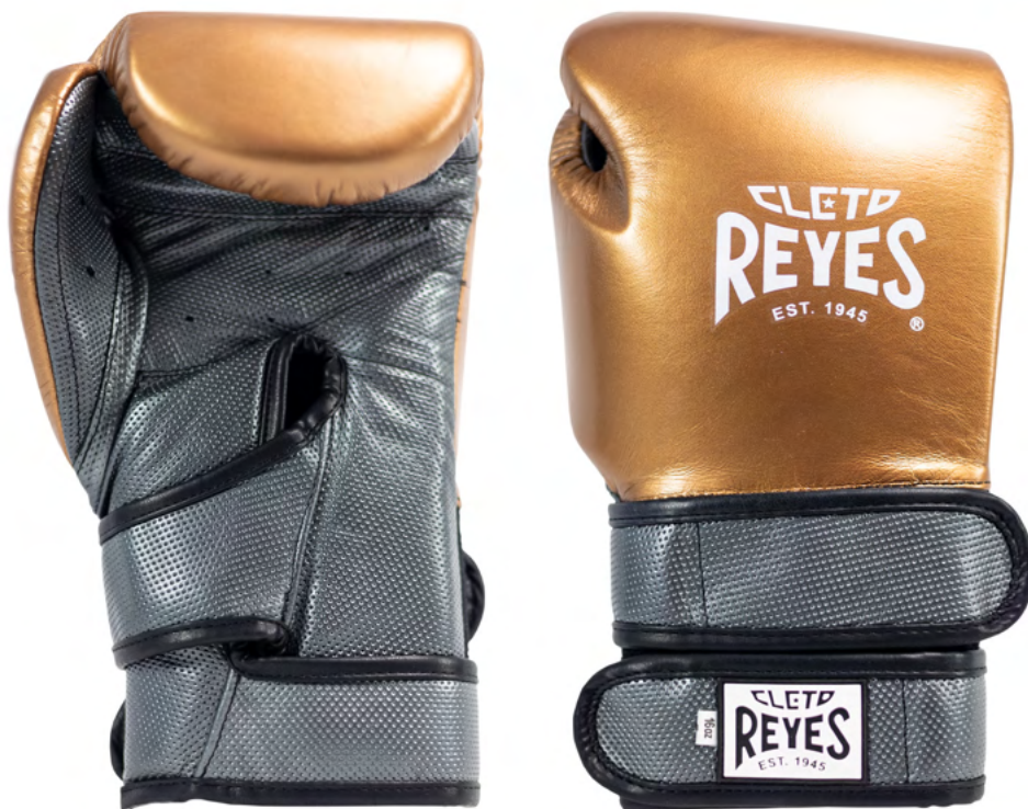
E500 | COOPER